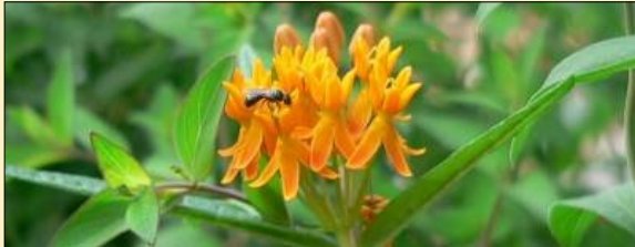
Butterfly Weed ( Asclepias tuberosa )

Morven Park, Main Parking Lot Southern Planter Lane, Leesburg